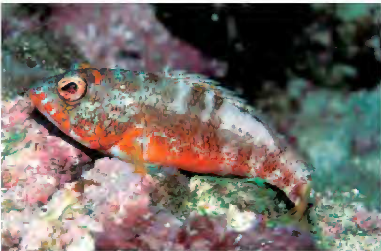
FIGURE 6. Rare color pattern (frightened animal) of Serranus pulcher from near Rolas Islet, São Tomé.